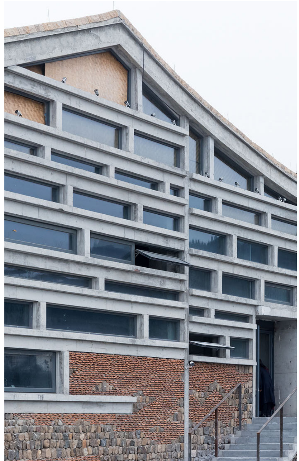
Fuyang Cultural Complex in Fuyang, China by Amateur Architecture Studio

We are proud to be convening and considering the role of architects and designers in actively repairing the cities and sites of transformation around the world.