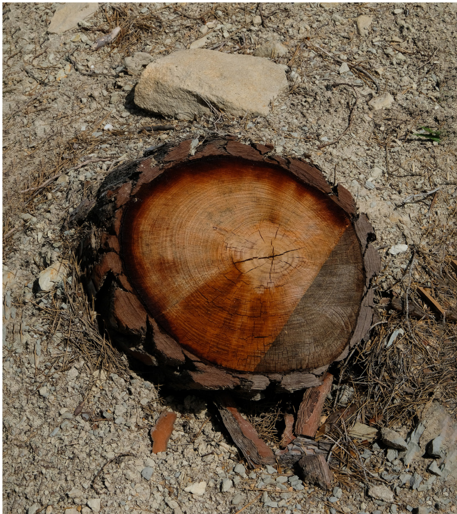
Solastalgia , Balearic Islands, Spain, 2021 by Pamela EA